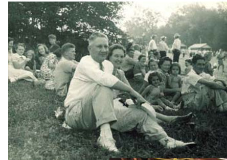
Remembering the Past