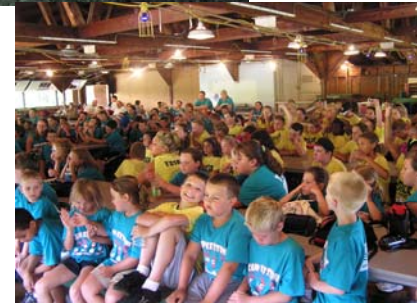
Building for the Future

2010 Reservations YMCA Camp/ARMCO Park Slippery Rock, PA 16057